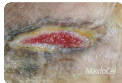
Wound after 12 days of MaxioCel treatment