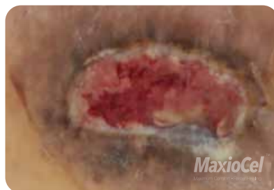
Wound before MaxioCel treatment