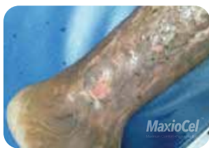
Wound before using MaxioCel