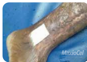
Using MaxioCel on the wounds